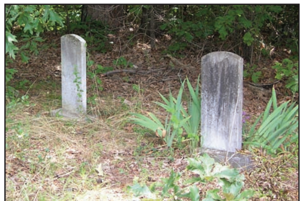
Cemetery in the Woods

Some examples of non-forested sites that you may want to consider protecting as special sites are caves, seepage slopes, rocky outcrops, riparian areas, water bodies (creeks, rivers, pools and ponds), natural openings in the forest such as prairies, glades and dry sandhills. These sensitive sites harbor many of the critically imperiled and imperiled aquatic and terrestrial species. Temporary pools that fill up with water in the spring are especially important features that contain rare, threatened and endangered species. All of these areas are important and are often very easy to work around.