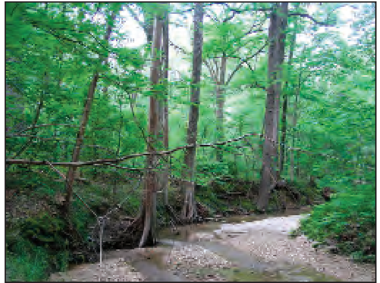
Riparian areas prove to be a valuable habitat for a wide variety of game and non-game species.

Burning – Low-intensity prescribed burning, done on a 3 to 5 year cycle, keeps brush, briars and saplings in the understory from becoming an impenetrable thicket. It also encourages grasses, forbs and legumes to germinate and grow.