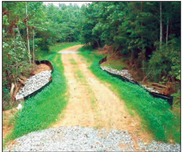
Corrective actions following harvesting activities protect your land from erosion and damage from log trucks.