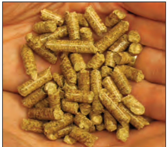
These pellets were made from woody biomass that is formed into an easily transported fuel for utilities or even special home heating stoves.