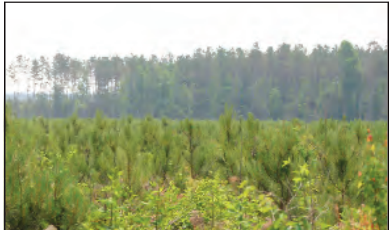
Proper planning prior to reforestation can ensure a healthy and productive forest in the future.

Louisiana Forestry Association can assist with contacting private/industrial firms with cost sharing or landowner assistance programs, http://www.laforestry.com