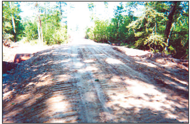
Culverts and road building are part of the BMP guidelines found in the Louisiana Recommended BMP manual.