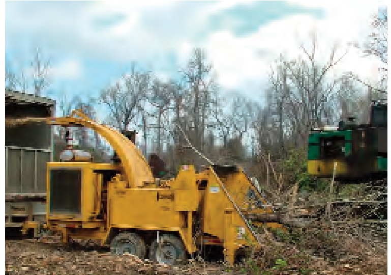
An in-woods chipping operation can add income from forest biomass.